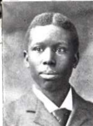
Paul Laurence Dunbar